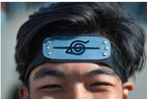
Halloween - Otaku Jatra